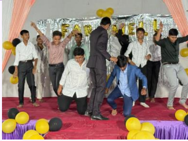
Photo Highlights - Post-Dinner Programme and Tag Ceremony