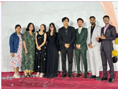
Photo Highlights - Cultural Performances and Activities

After the energetic performances, dinner was arranged for all the students and teachers. Everyone enjoyed the delicious meal together while sharing conversations, laughter, and memories. The dinner provided a relaxing break and strengthened the bond among students and teachers.