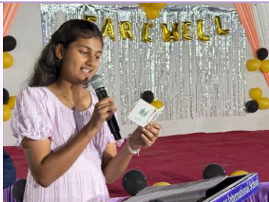
Photo Highlights - Closing Ceremony

The farewell celebration ended with smiles, emotions, and heartfelt wishes for the seniors as they prepared to move forward toward new opportunities and challenges.